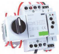
Emergency Lighting Control